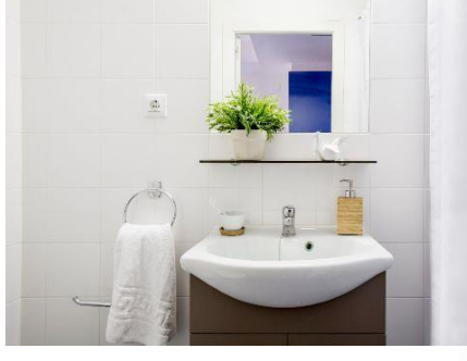
microwave and a study space.

There is also a small kitchen with ceramic hob and