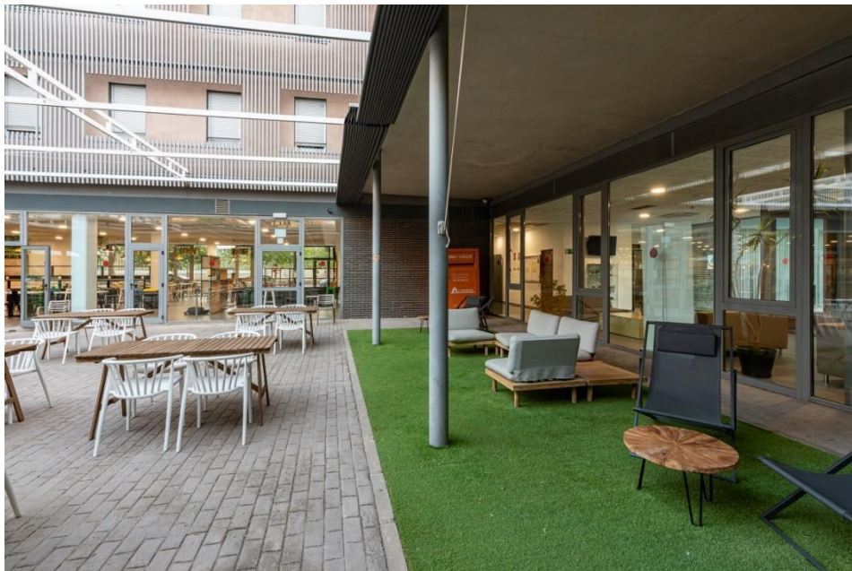
Resa Damià Bonet University Residence Campus dels Tarongers, Carrer del Serpis, 27, 46022 Valencia

The residence is modern, spacious and with premium facilities and services. It is located in a perfect area, exactly on Calle Serpis 27, right next to the Centre d'Idiomes UV on the Campus dels Tarongers de la UV. The comfort of the students is one of its main principles and the location of the building facilitates quick access to the classes of the language centre and the university area.